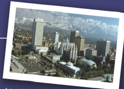
1996 Salt Lake City