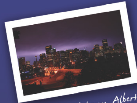
1993 Calgary, Alberta