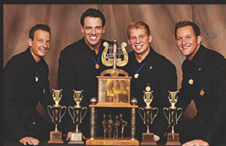
OC Times 2008 International Quartet Champion