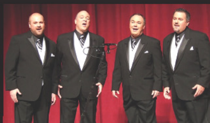
Masterpiece 2008 Far Western District Quartet Champion