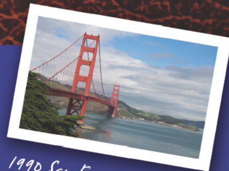
1990 San Francisco

Orders received after May 22, 2009 will be held at Will Call.